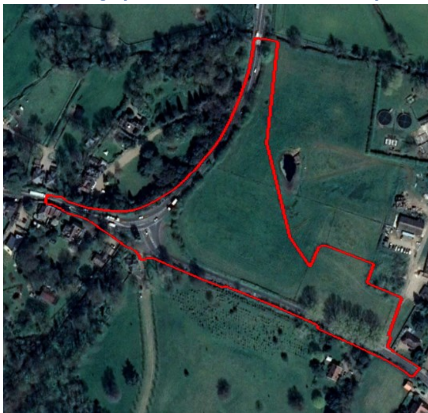
Plate 1: Aerial imagery of the site and redline boundary